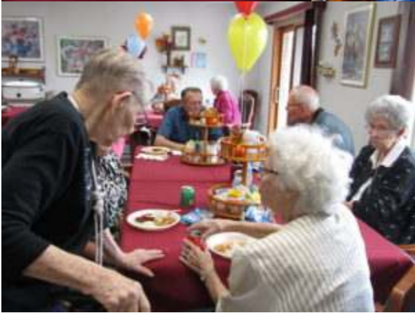
Wednesday: Movie & Snacks