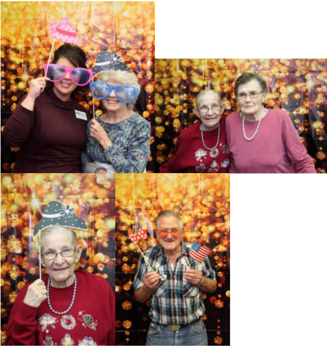
Tuesday: Tailgate Party!