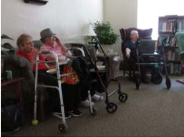
Thursday: Senior Olympics and Gering and a stop at Double L Cafe for ice cream/pie!